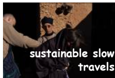
sustainable slow travels