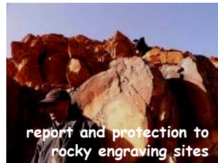
report and protection to rocky engraving sites