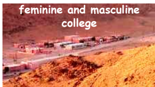
feminine and masculine college