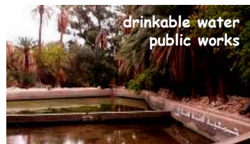
drinkable water public works