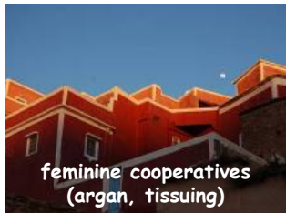
feminine cooperatives (argan, tissuing)