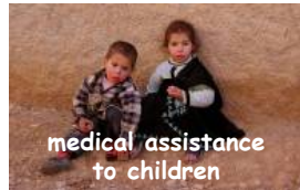
medical assistance to children

the primary school essaadiyine of tiwadou hosts 122 children, and it is split into three sections located in the surrounding villages; on the road between tiwadou and souk el hadd issi there is the new both feminine and masculine college designed by mohamed